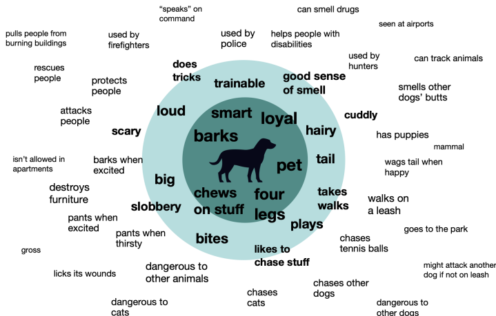
Figure 1: A dense core model of DOG stereotypes.

Fig. 1 is an illustration exhibiting a possible stereotypical structure associated with the concept DOG: