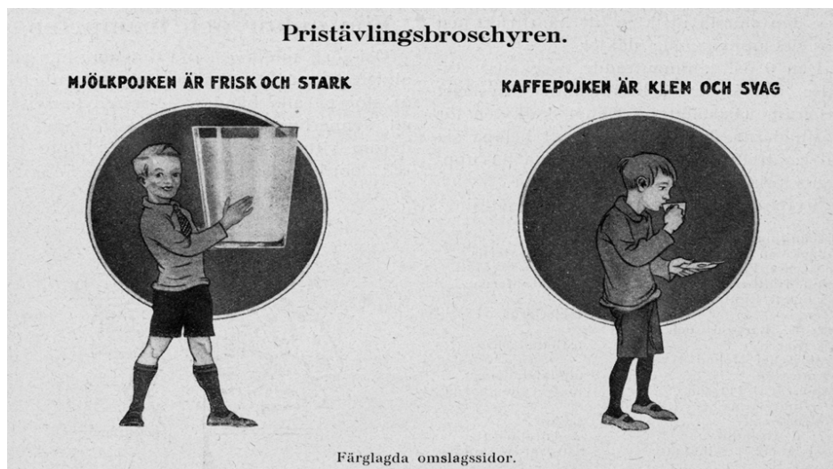
Fig 2. 'Pristävlingsbroschyren', Mjölpropagandan. Sweden, 1926. http://blog.soziolegie.de/2014/12/die-moderne-als-bildprogramm/