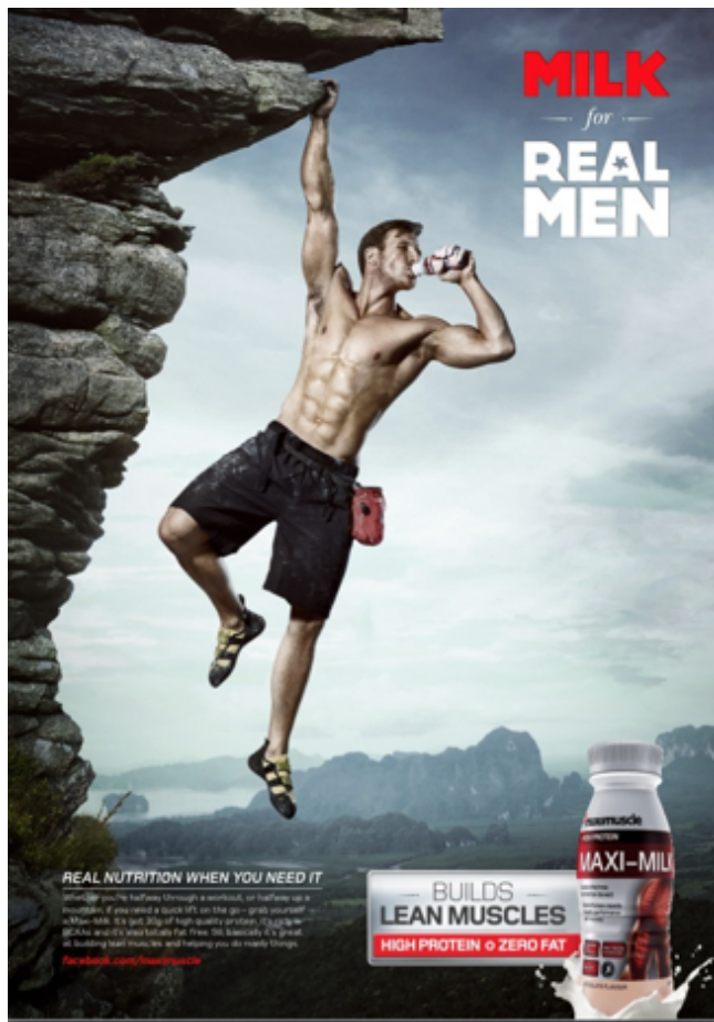
Fig. 3: ‘Milk for Real Men’. Maxi-Milk, USA, 2012; SeanLerwill.com, 30 Aug. 2012, http://www.seanlerwill.com/maximusclemaxi-milk/ .

As the next section discusses, the alt-right also uses milk to construct tropes of ‘milk masculinities’, with dairy being used to exemplify whiteness and virility and plant milk – in particular soy milk – being used as a symbol of weakness and emasculation.