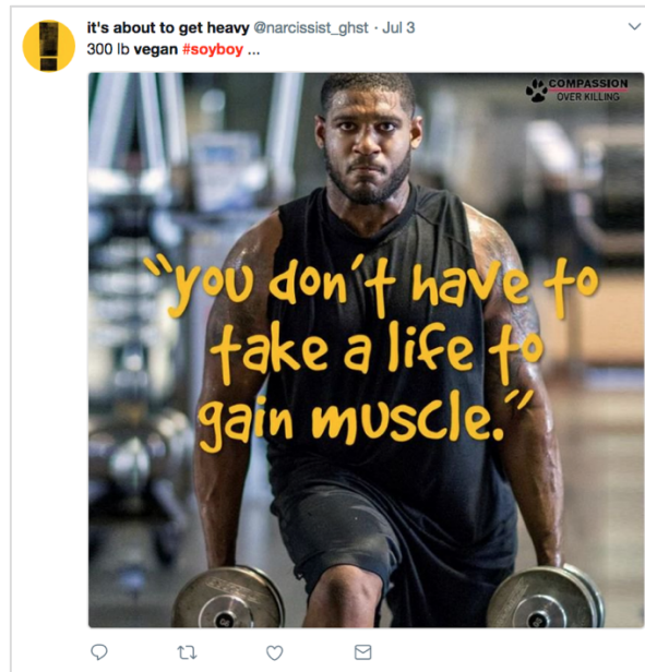
Fig. 10: '300 lb vegan #soyboy'. Twitter.com , 3 July 2018, https://twitter.com/narcissist_ghst/status/1014233764552232960 .

The #SoyBoy hashtag is sometimes used in more generic posts by the vegan community, accompanying images of vegan food. 37 Like the athlete, bodybuilding, and other #SoyBoy tweets depicting stereotypically masculine men, the point of these tweets appears to be to create a narrative where a vegan 'soyboy' lifestyle can be not only sufficient but even superior to a dairy-and-meat-based diet, even for strong masculine western men (or women). 38