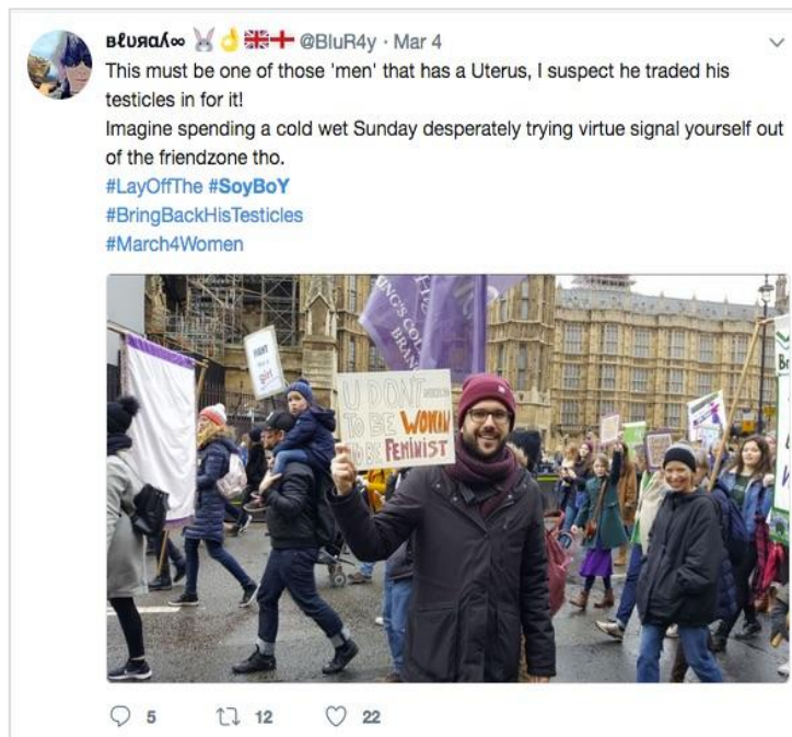
Fig. 4: ‘U don’t need to be a woman to be a feminist’. Twitter.com, 4 March 2018, https://twitter.com/BluR4y/status/970314826890260485 .

A tweet from October 2017 illustrates how soy is seen as a transmitter of weakness whether it is consumed or not, claiming that ‘Soy is a metaphor for weakness. One can be a soyboy even if soy milk never passes his lips.’ 22 Similarly, a tweet from March 4, 2018 illustrates the idea of a ‘soy boy’ being used as a metaphor for emasculation (fig. 4). Depicting a man at what appears to be a women’s rights march smiling proudly holding a ‘U don’t need to be a woman to be feminist’ sign, the caption states, ‘This must be one of those ‘men’ that has a Uterus, I suspect he traded his testicles for it!’ #LayOffThe #SoyBoY #BringBackHisTesticles #March4Women. 23