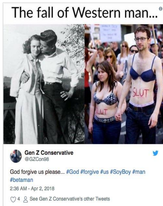
Fig. 8: ‘The Fall of Western Man’. Twitter.com, 2 April 2018, https://twitter.com/GZCon98/status/980604732870819840